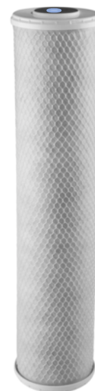
4.5"x20" Sediment, Carbon Block Filter with Scale Reduction Media

Polyphosphate has been tested and certified under ANSI/NSF Standard 42: Drinking Water Treatment Units- Aesthetic Effects ANSI/NSF Standard 60: Drinking Water Treatment Chemicals-Health Effects, for use in potable water systems at concentrations up to 10ppm.