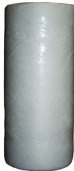
Melt Blown DGD Cartridge