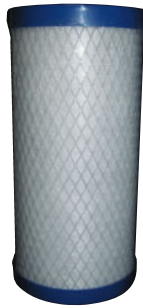
Big Blue GAC Cartridge