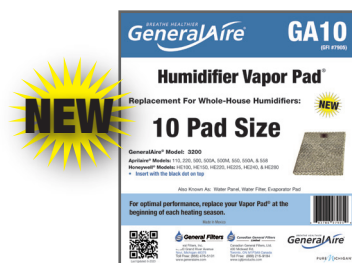
For Model 3200 (GFI #7905)