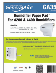
For Model 4200 (GFI #7902)