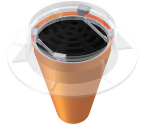
Replaceable Sediment Bag

Remove the bag by loosening or cutting off the clamping band. Take the new filter bag, which is equipped with a stainless steel worm drive clamping band, and use a screw driver to tighten the bag around the frame channel. Ensure the bag is secure and that there is no slack around the perimeter of the band.